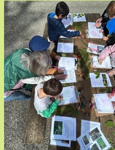
Photo: Docents assisting students with their plant identification.

On March 30, the Tribal Life Trail, located at the Lake Wilderness Arboretum in Maple Valley, once again hosted the Lake Wilderness Elementary School second graders for their annual field trip. As part of the Washington State education curriculum, the students study Puget Sound Indigenous Tribal Life. The Tribal Life Trail is a perfect fit for this portion of their studies.