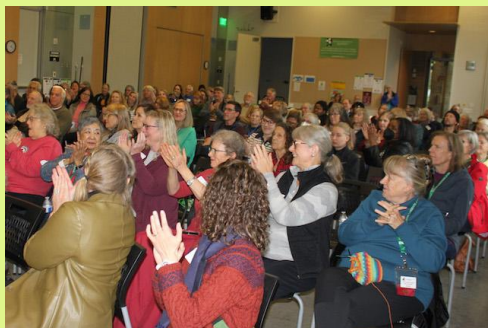
The audience applauds at the Member Appreciation Event.