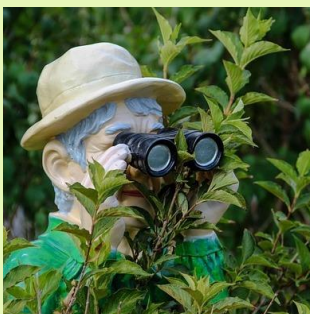
Photo: Leaves of the Garry oak tree, Quercus garryana.