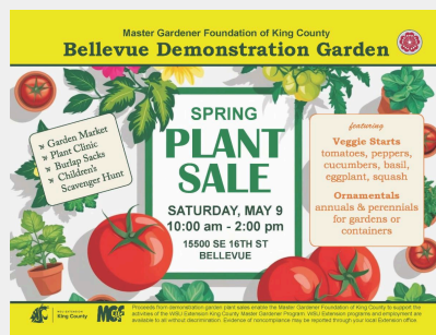
Bellevue Demonstration Garden Spring Plant Sale

Visit the events below to stock up while supporting the WSU Extension King County Master Gardener Program & the Master Gardener Foundation of King County.