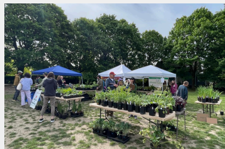
Tilth Alliance Spring Plant Sale