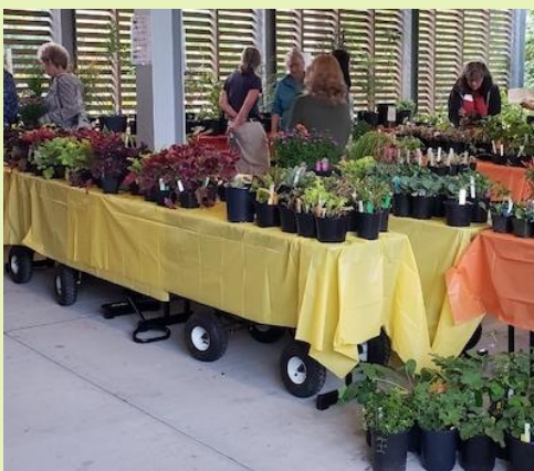
Shoppers at the Cool Plants, Hot Topics! plant sale.